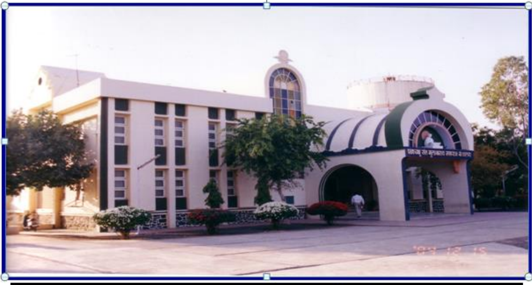
Department of Library SSGMCE, SHEGAON 444 203

Pradnya Chakshu Sant Gulabrao Maharaj Granthalaya